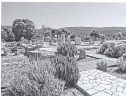
The Temple of Messa, built in the 4th Century BC and dedicated to the Gods Zeus, Dionysus and Hera