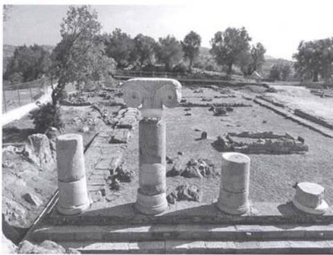
The Sanctuary of Apollo at Klopedi, 8th Century BC