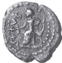
Coin from the city of Eressus, featuring Sappho, 1st - 2nd Century CE