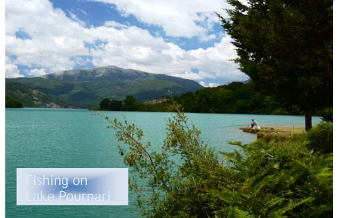
Fishing on Lake Pournari