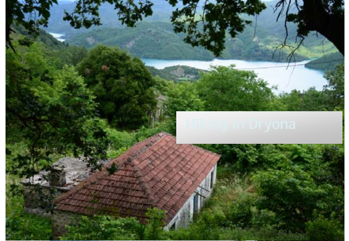
Hiking in Dryona

Waterskiing, windsurfing, beach volley - for both young and old - are available on the fabulous beaches of Parga.