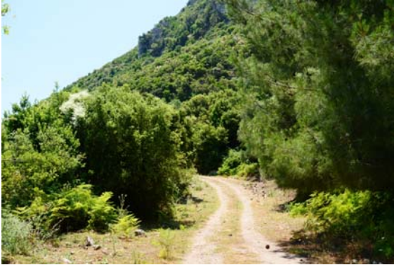
FOREST TRAIL ON MT. PEZOVOLO