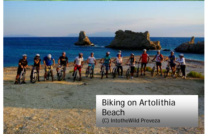
Biking on Artolithia Beach