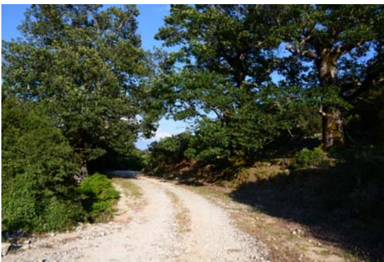
FROM ANO SKAFIDOTI TO KORYFOULA

There is a dramatic and unfiltered beauty in the historic land of Southern Epirus. Sunblasted beaches and rugged mountains, swirling rivers and lush woodlands, make up a unique natural mosaic that awakens the senses and creates an unparalleled travel experience.